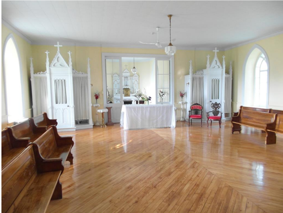
Chapel behind the Tabernacle

He also showed us the basement of the church. It contains a large wood boiler used to heat the church. He is the volunteer that starts the boiler several hours before a planned church event. Every year he and several volunteers cut many cords of wood and pile it up in an adjoining room in the basement.