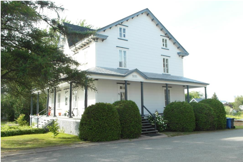
Picture of the house taken in July 2018